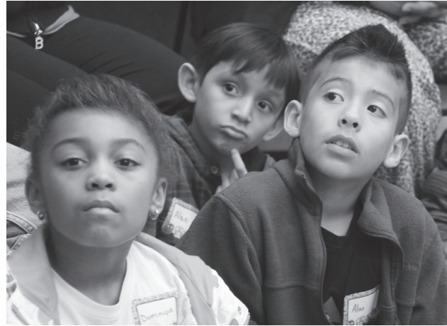
Eager learners at Prime Time Family Reading in Lynnwood.