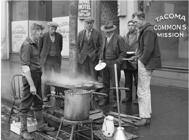
An image from the Hope in Hard Times Traveling Exhibit.

Humanities Washington's mission is to spark conversation and critical thinking using story as a catalyst, nurturing thoughtful and engaged communities across our state. Our programs are how we make this happen: