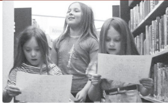
To accompany Humanities Washington’s traveling exhibit, the Asotin County Library hosted a “Be a Time Traveler” day with puzzles for children.