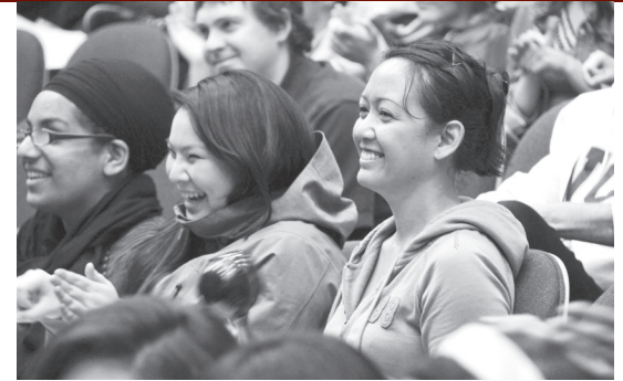
Participants enjoy themselves at a Speakers Bureau talk in Bellingham in 2013. | Photo by Adam Knight