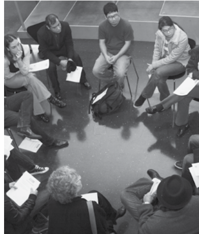
Sharing stories at Beyond Talking Points.