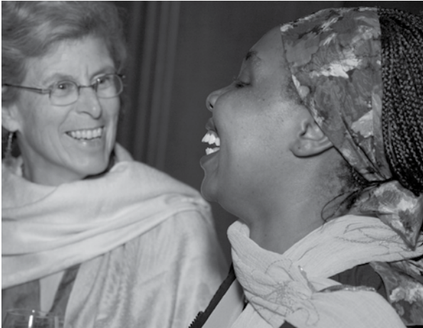
A conversation at Bedtime Stories 2010.