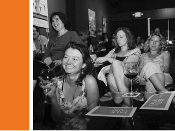
Attendees at the inaugural Think & Drink in Seattle.

Humanities Washington's mission is to spark conversation and critical thinking using story as a catalyst, nurturing thoughtful and engaged communities across our state. Our programs are how we make this happen; some highlights from 2010 and 2011: