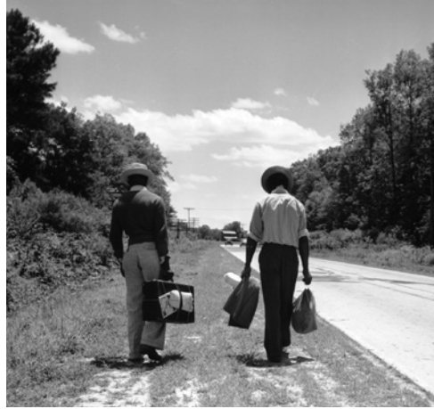
An image from the Journey Stories Traveling Exhibit.