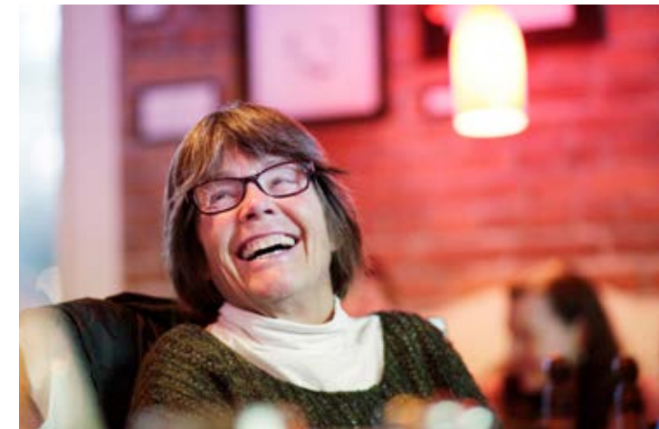
Think and Drink event attendee.