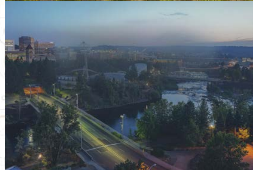
Washington State Photos (top to bottom): Peninsula. Photo by Jës; Chelan. Photo by Howard Ryder; Spokane. Photo by SimplyAmy74