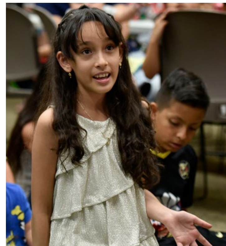
Prime Time Family Reading participants.

Weed Warriors Wenatchee Public Library Wenatchee Valley College Wesley Homes Westport Timberland Library Whatcom Community College Whatcom Museum Wheelock Library Whidbey Institute White Center Heights Elementary School White Center Library White River Valley Museum White Salmon Valley Community Library Willows Preparatory School Woman's Club of Olympia Write253 Yakima Valley Community Foundation Yakima Valley Museum Yelm Timberland Library