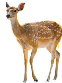
The Bush Deer