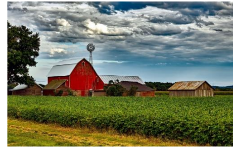
On a farm