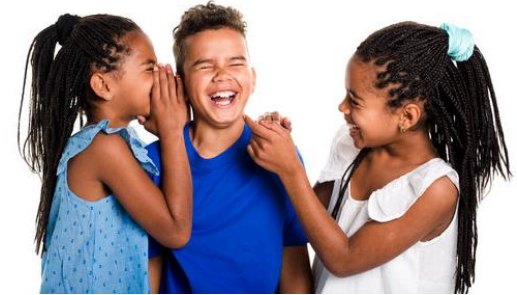
Talk to a friend