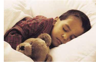
Take a nap