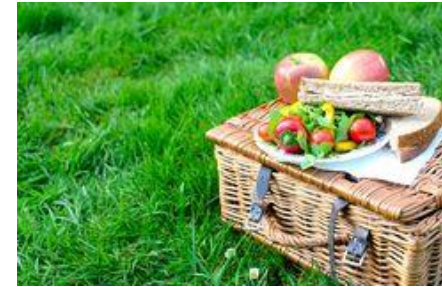
Have a picnic