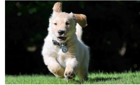
Chase a puppy