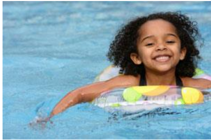
Go to a pool