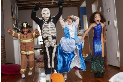
Play with friends