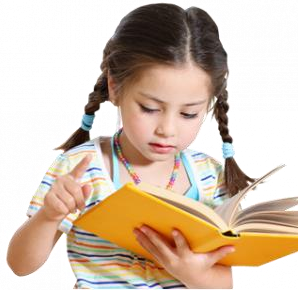
Read a book