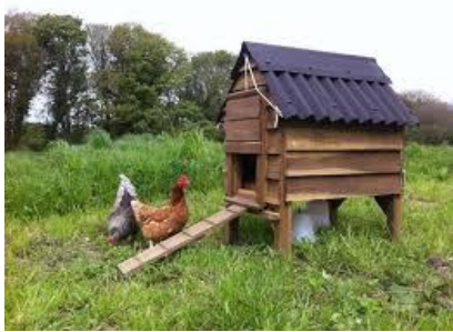
A hen house