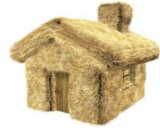
A straw house