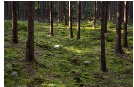
Walk in a cool forest