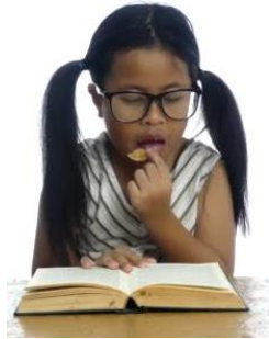
Read a book