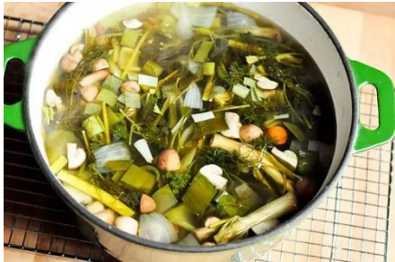
Make a soup