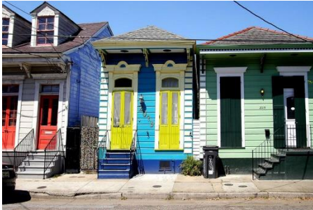
In my neighborhood