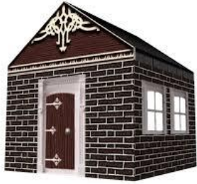
A brick house